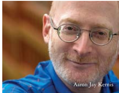
Aaron Jay Kernis