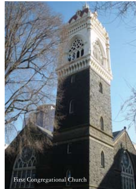
First Congregational Church