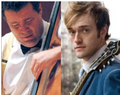
Edgar Meyer and Chris Thile